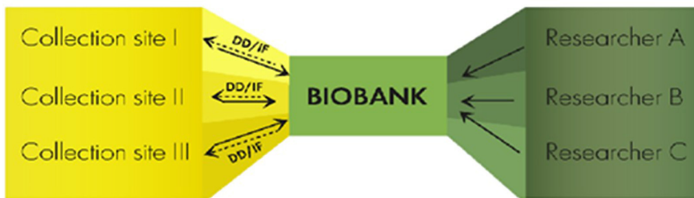
Figure 2. Model biobank demographics and structure. DD – diagnostic discrepancy; IF – incidental finding.

41% have model C - multiple collection sites