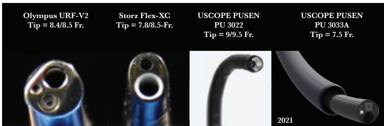
Figure 1. The flexible scopes used in our study.

In cases in which the access sheath or the ureteroscope could not be inserted, a double J stent was placed in order to recalibrate the ureter. The average operative time was slightly higher in group 1 compared to group 2 (47 versus 39 minutes, respectively), while the overall stone-free rate (SFR) at 1 month was lower in group 2 than group 1 (76.3% versus 86.8%, respectively). At 3 months, no significant difference was found between the two groups regarding the stone clearance rate. The stone-free status was not achieved in cases