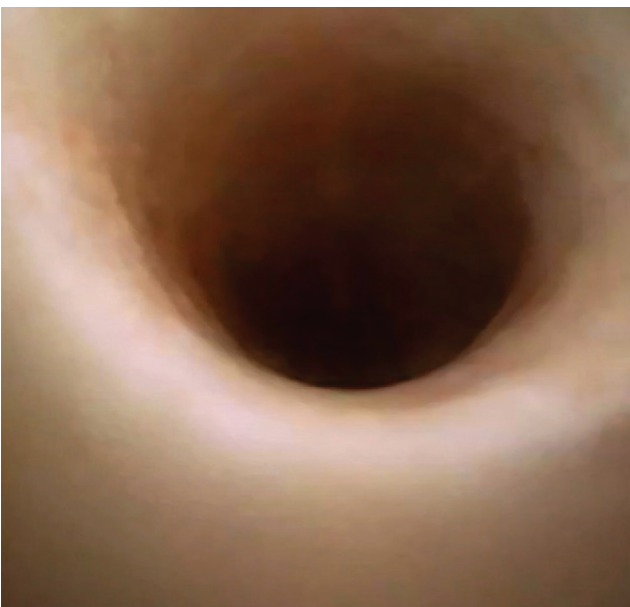
Figure 3. Normal aspect of the ureteral urothelium after using of the UScope PU3033A.

The average urinary tract infection rate was slightly higher in group 2 compared to group 1 (11.1% versus 9%, respectively). One case of sepsis was encountered in group 2 and was solved by intravenous antibiotics. The mean hospitalization period was longer in group 1 compared to group 2 (21 versus 29 hours, respectively). Regarding the single-use ureteroscope (7.5 Fr), the facile insertion, lack of mucosal ureteral wall lesions, and same-day discharge were outlined as main advantages (Figure 5).