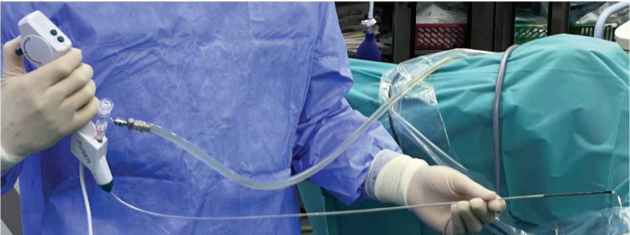
Figure 2. The new single-use digital flexible ureteroscope PU 3033A (7.5 Fr).

of lower pole calculi that were difficult to access. The average calculi diameter in which complete stone clearance was obtained was 16 mm in group 1 and 14 mm in group 2.