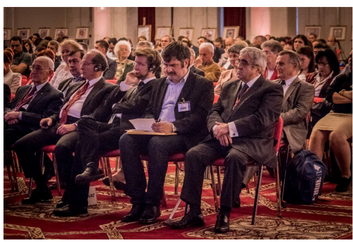
Fig. 2 Participants in the Congress

Moreover, the latest subjects that were discussed and that enjoyed a numerous participation and a special attention, are the following: Unrestricted Educational Grant from Biomedica: High-end molecular technologies in human diagnostic; Impact of atrial fibrillation in hematological, endocrine, gastroenterological, and neurological disorders; Interdisciplinary researches for innovative therapeutical systems development; From fundamental neuroscience to clinical practice in child and adolescent psychiatry; Patient-physician communication: Online communities, ethical perspectives, and patient satisfaction; Romanian Geriatrics and Gerontology at 65 years of presence in Europe: Prevention, intervention or anti-aging; Interdisciplinarity from the Dental Medicine perspective; Contemporaneity and interdisciplinarity in pediatric pathology; Multidisciplinary approach of the coronary artery disease: From the atherosclerotic plaque to management.