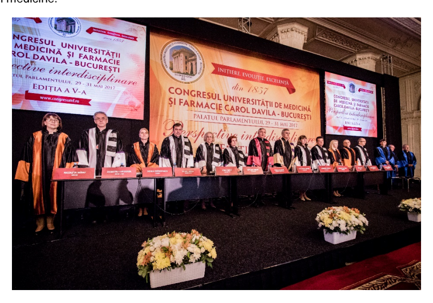
Fig. 4 Members of the Senate of "Carol Davila" University of Medicine and Pharmacy in Bucharest, Romania

The Congress also occasioned the awarding of the "Honoris Causa" title to some remarkable personalities in the field of universal medicine.