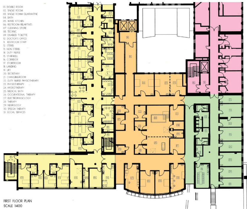
Fig. 1. Floor plan of the first ever special unit of early neurorehabilitation in neurosurgery designed and established by the author to offer the patients neurosurgical know how and trans-disciplinary treatment in case of multiple injuries and secondary complication at any time.

and humanistic nursing providing a clean environment, an adequate primary nursing system, and easy and quick access of medical care to prevent and treat secondary and tertiary complications (9,23) Nevertheless the question of long-term survival is a matter of ongoing and controversial debate in the scientific literature and in the lay press. There are different opinions as to how long such patients could live and how long they do live in special rehabilitation centres, in nursing homes, or at their home with relatives.