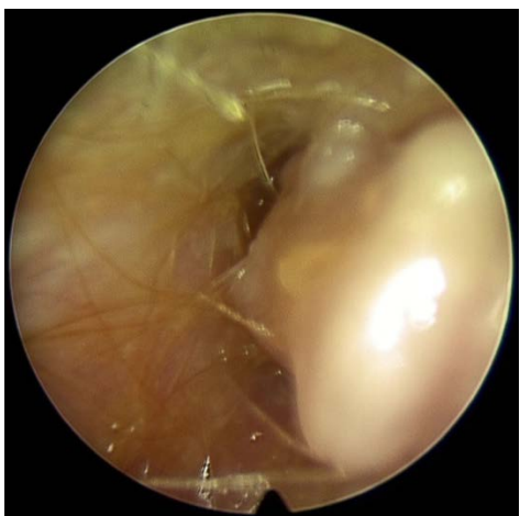
Fig. 1 Multiple, irregular shaped osseous tumors in external ear canals: the left and the right side respectively; no space left for the examination of the eardrums

A CT-scan was performed and normal middle ear spaces were identified, on both sides, with clear visible eardrums. The external halves of the ear canals were obstructed by multiple osseous tumors, with relatively small insertion pedicles (compared to the tumors) and spiky, irregular surface. The internal part of the ear canals were: free on the right side and full with a soft mass on the left side (explaining the symptoms of our patient) (Fig. 2).