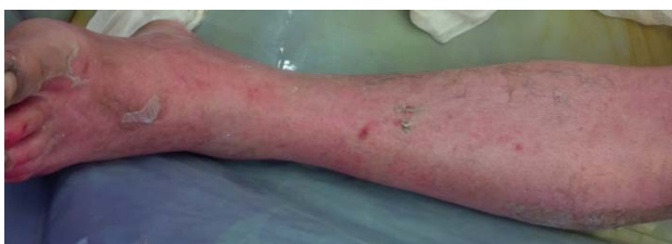
Fig. 3 Lower left limb with healing burns, after a couple of days from entering our unit