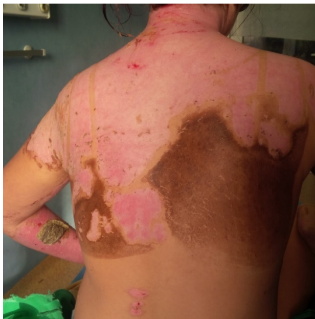
Fig. 15 Burns on posterior trunk were completely healed after 5-6 days from applying Acticoat. We noticed that there was a small area left on the volar left arm, where Acticoat could not be removed, as the area was still healing. We also noticed a discoloration of the regular skin, which was normal, due to the contact with the Acticoat sheets that contained silver ions. That darker color usually disappears when washing thoroughly, eventually with a sponge. However, it was completely harmless