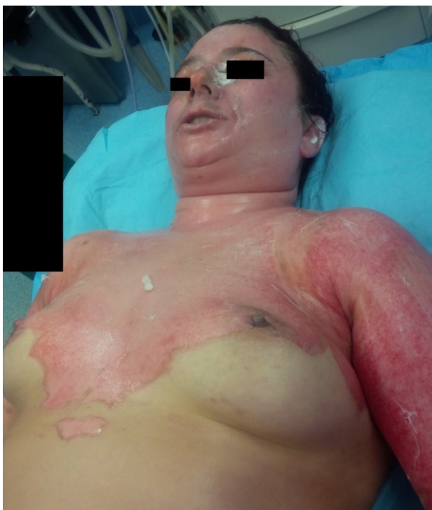
Fig. 13 Burn wounds (2nd and 3rd degree) on the face, anterior cervical area, anterior trunk, shoulders, and posterior cervical area at the admission in our unit (~ 12 hours after the accident, after surgical debridement in another hospital)

The patient was admitted in our unit at about 12 hours from the injury, after first being treated in a smaller hospital, outside Bucharest, where a surgical debridement of the wounds was performed and dressings with Silver sulfadiazine cream (Dermazin) were applied. She displayed burn wounds that did not hurt much, with pink dermis alternating with some whitish areas. We were concerned that the lesions were not painful, but it was probably due to the shock and the medication she had received, as they proved to be more second degree with only some small areas (~ 5% TBSA) of third degree on the left side of the neck and the thorax. She was a very strong, positive, non-smoker, healthy woman, who only had two C-sections and myopia forte in her medical history.