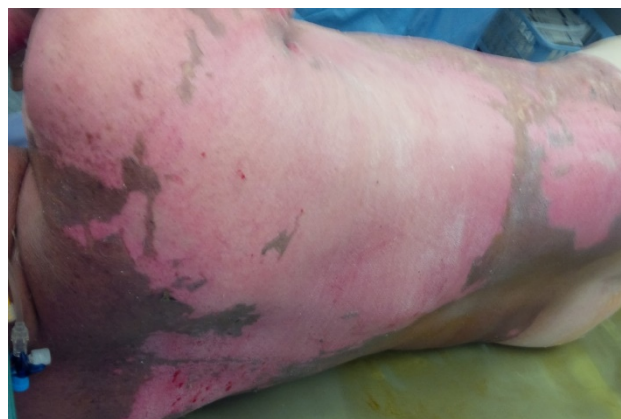
Fig. 6 Posterior trunk healed - after removing Acticoat dressings (~5 days after having applied them)