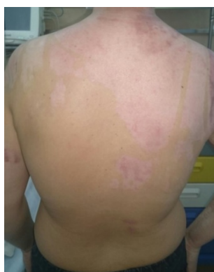
Fig. 16-18 Post-burn pinkish scars on anterior thorax and upper limbs that produced no functional limitation and showed no tendency of turning pathological. White scars on posterior trunk. All of them at ~ 7 months from the accident