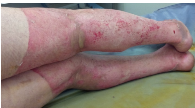
Fig. 4 Lower limbs with healing burns, after a couple of days from admission. We observed that the burns were dry and there were small epithelization isles

After the first week, when his general state got better, silver sheets (Acticoat) were applied on his trunk and on his right upper extremity, where the lesions were deeper and seemed to heal slower than in the other above-mentioned areas. They were kept in place for 3-5 days, depending on the progress of the area. In the meantime, the patient got better and better and was transferred to the regular burn department.