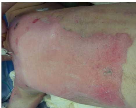
Fig. 5 Burn wounds on the anterior trunk healed completely - this picture was taken when removing Acticoat (silver sheet dressing) - 4 days after having applied it

The burn injuries on his trunk were slowly healing. Some difficulties were encountered, as he refused to comply with our indication of not lying only on the back, so he developed small eschars on the heels, in spite of the special mattress and of the staff turning him on the sides and on the belly, as indicated in such cases. Once more silver dressings were applied, that time Atrauman Ag. The lesions were not exudative anymore, but still a bit wet and the patient's body healing reserves were quite depleted, in spite of the administered vitamins and hyper-protein diet, so the epithelization process needed to be boosted. In addition, we thought that a mesh-like dressing, as the one we used, would help. After another week of daily psychological therapy sessions with the psychologist in our unit, he started walking by himself: it was a miracle for us to see him like that. He was discharged completely healed, with still evolving scars that did not show any sign of turning pathological. The small eschars on his heels were slowly healing, too. He was recommended to use scar gel (with onion extract and another one that was silicone based) (Fig. 7-9).