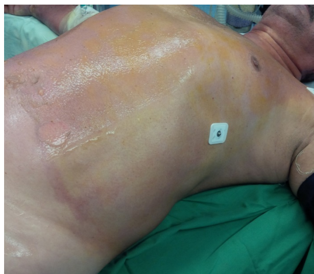
Fig. 2 1 st , 2 nd A and B degree burns on anterior trunk, a couple of hours after the accident, pink moist, very painful

After removing the blisters and the dirt, there were areas of red-pink and white dermis that was moist in some regions and dry in others. The image was that of a “chess-board”, due to the color alternation, suggesting the alternation between different degrees of burn lesions. The patient was kept, treated, and monitored in the intensive care unit for ~ 2 weeks. At some point he needed intubation and ventilator support, but his local evolution was very good. In the first couple of days, while the burn wounds were very exudative, an ointment based on zinc oxide (that was prepared in our unit) was applied (Fig. 3,4).