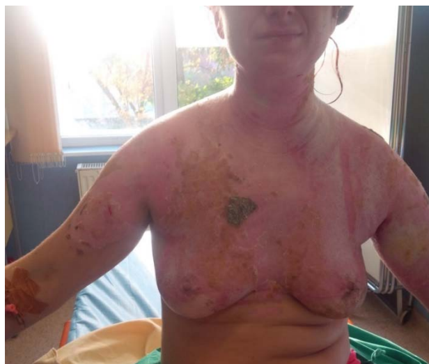
Fig. 14 Burns on the anterior thorax and upper limbs healed almost completely after 7 days of having Acticoat sheets applied on them. There were still some small areas like the one on which Acticoat was still adherent (anterior thorax), one on the left breast and the left upper arm, which were still in the process of healing, due to being probably of 2 nd B to 3 rd degree. The face was completely healed too after 4 days from applying Acticoat

The results were the following: on the fifth day, the face and ears were completely healed and the removal of the Acticoat sheets that had already detached themselves from the skin was started. The back side of the trunk and neck were ~ 95% healed with only a couple of small areas that were still healing (Fig. 14,15).