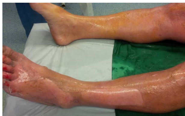
Fig. 1 2 nd A and B degree burn lesions on lower left limb, a couple of hours after the accident, pink moist, very painful

and insular ones on his trunk, his right arm and both his hands (Fig. 1,2). No escharotomies were performed, as they were not necessary, but the surgical debridement of the lesions was immediately performed.