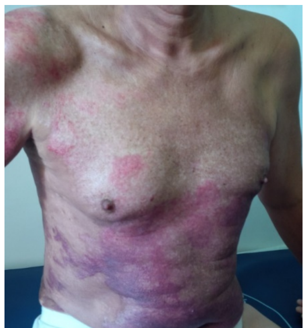
Fig. 7-9 Upper right limb, posterior trunk and respectively anterior trunk of the patient, with healed burns, post-burn "nice-looking", red, pinkish and violet scars, some white coloured areas, too, showing no signs they were prone to hypertrophic/ keloid development – at discharge from our unit, 24 days after the accident

After 3 months from the discharge, the patient's scars showed signs of turning hypertrophic/ keloid in some regions: the right scapular area, the right flank, some dot-like areas on the back and on the anterior thorax, also on the right arm (Fig. 10,11).