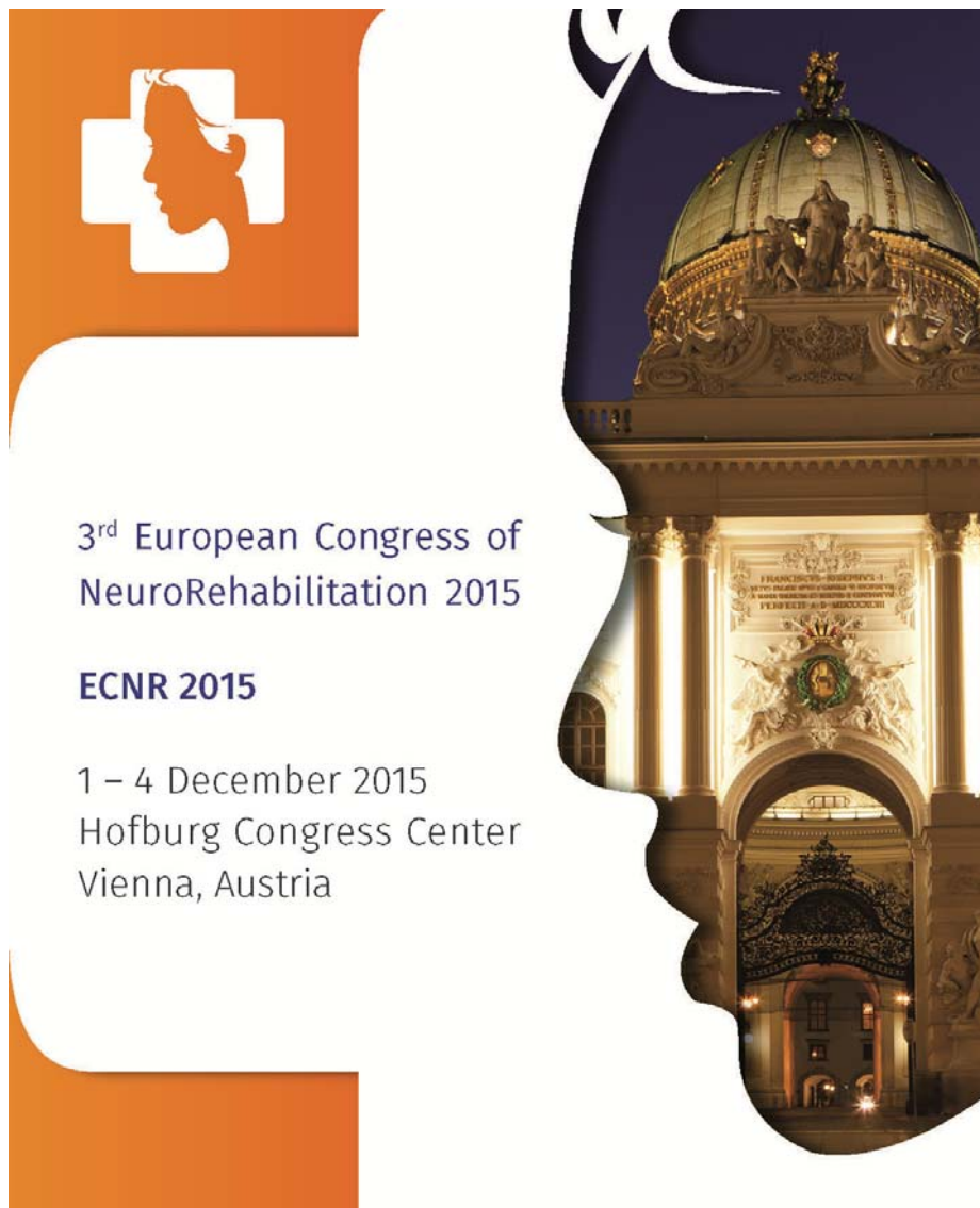
Fig. 1 3 rd European Congress of NeuroRehabilitation, Vienna 2015

The latest accomplishments in neurorehabilitation research were presented during the event. The participation of a great number of renowned speakers raised to excellence the scientific quality of the congress manifestations.