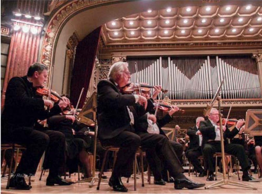
Fig. 3 “Dr. Ermil Nichifor” Physicians Orchestra in Bucharest