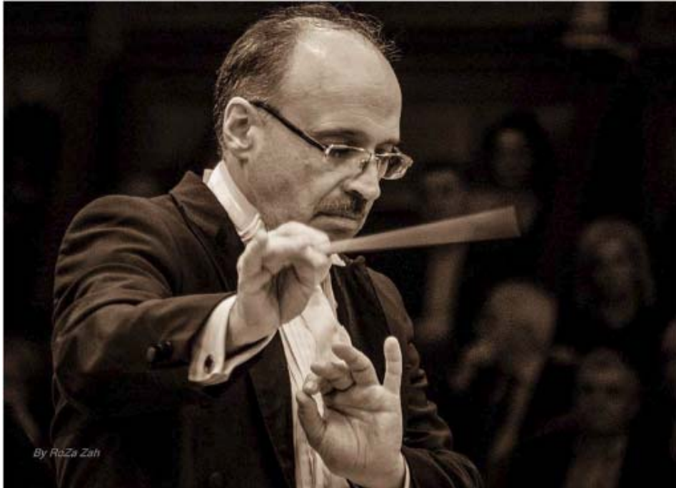
Fig. 5 "Dr. Ermil Nichifor" Physicians Orchestra in Bucharest, "Christmas and New Year's Festive Concert" at the Romanian Athenaeum

The artistic program also included some important music pieces belonging to the universal classic music treasure, such as: J. STRAUSS (Viennese Blood and Blue Danube waltzes, Hunting Polka and Thunder and Lightning Polka), G. VERDI (La Traviata, Prelude to Act 1), P.I. CEAIKOVSKI (Sleeping Beauty Waltz), P. MASCAGNI (Intermezzo from Cavalleria Rusticana), SOSTAKOVICI (Waltz 2), E. DOGA (The waltz of the century), L. ANDERSON (A Christmas Festival), all being interpreted devotedly and with talent and profusely offered to a connoisseur auditorium.