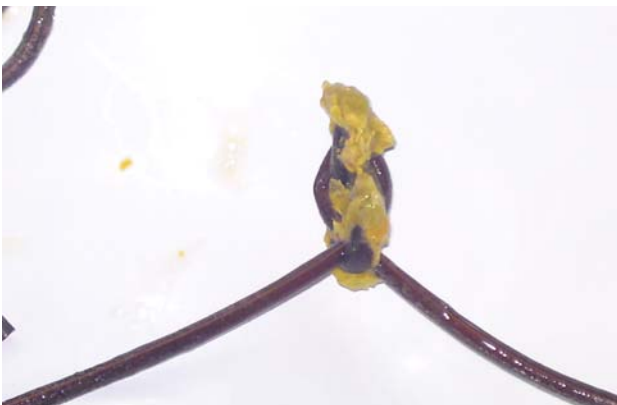
Fig. 2 Jejunal tube, detail: A knot around a bezoar.

We decided to extract it with a polypectomy snare after cutting its abdominal side. The extraction was made easily and without complications. (Figure 2)