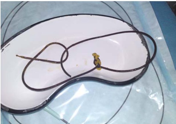
Fig. 1 The jejunal tube after extraction.

patient had an upper endoscopy. The PEG gastric tube was at its place, in good position, but the jejunal tube was knotted in the stomach around a bezoar. (Figure 1)