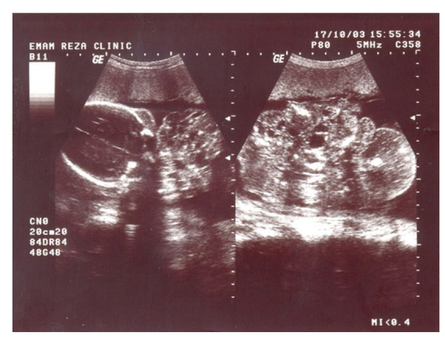
Figure 1: A heterogeneous, cystic-solid mass with calcified portions, anterior to the face.

Although the tumor was massive and it concealed the face, the main source of the tumor was not evident; none-